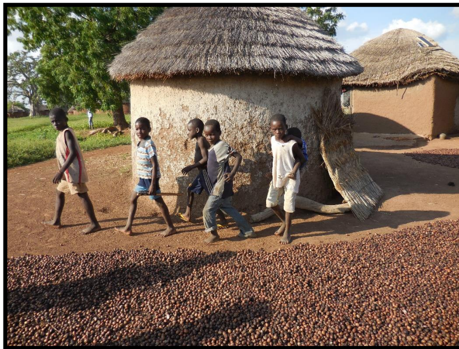
Scenes from the Motherland